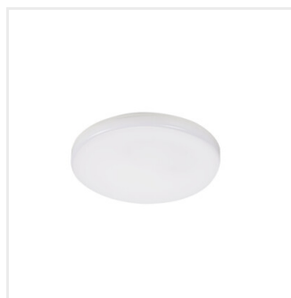
DUNO PRO 15W-NW-O