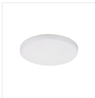
DUNO PRO 24W-NW-O